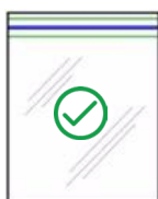
PLASTIC STORAGE BAG