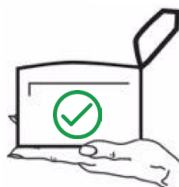
SMALL CLUTCH PURSE